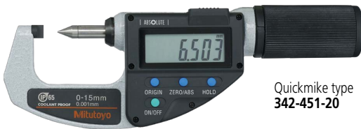
Quickmike type 342-451-20