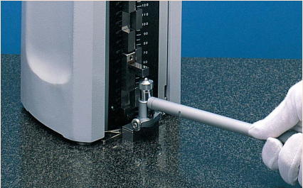
Bore gage zero-setting