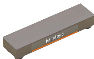
601645 100 (W) x 25 (D) x 12 (H) mm