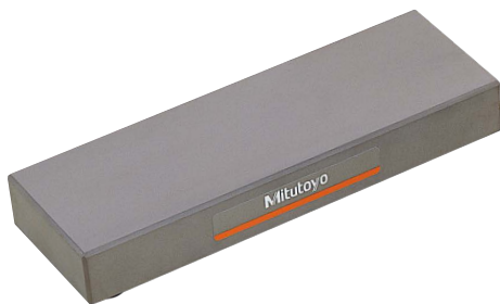
601644 150 (W) x 50 (D) x 20 (H) mm